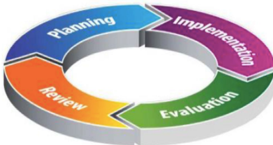
Quality assurance and improvement cycle

All the Skillman project Curricula have been developed to implement the indicators included in the “Recommendation on the establishment of a European Quality Assurance Reference Framework for Vocational Education and Training” of EQAVET [ http://www.eqavet.eu/gns/home.aspx ], accomplished through common principles for quality assurance.